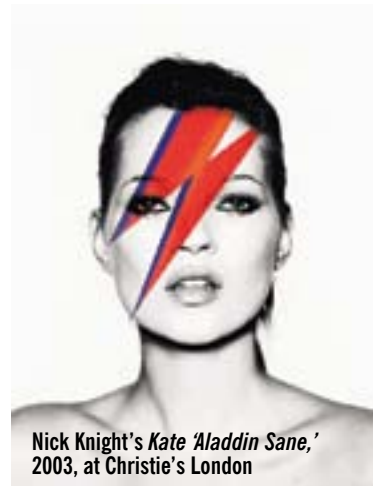
Nick Knight's Kate 'Aladdin Sane,' 2003, at Christie's London