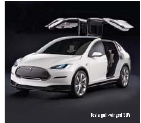
Tesla gull-winged SUV

We are salivating over the fall launch of innovative carmaker Tesla's gull-winged SUV, the Model X . The sleek, smart and subtle looks of this electric vehicle confirms that green design can be good design. At Tesla Motors Dallas ; reservations through teslamotors.com/modelx. Seth Vaughan