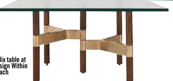
Helix table at Design Within Reach