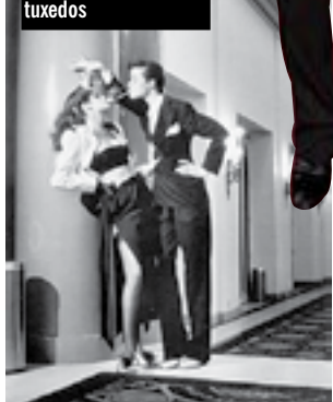
Helmut Newton, Yves Saint Laurent, Rue Aubriot, Vogue France, 1975, Paris