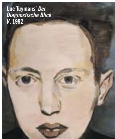
Luc Tuymans' Der Diagnostische Blick V. 1992