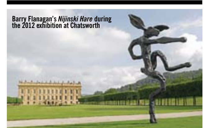
Barry Flanagan's Nijinski Hare during the 2012 exhibition at Chatsworth