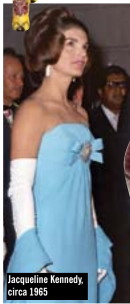
Jacqueline Kennedy, circa 1965