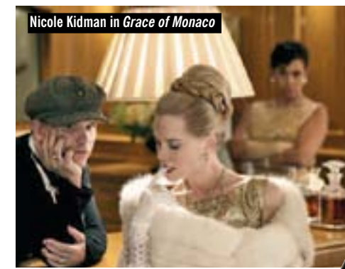
Nicole Kidman in Grace of Monaco