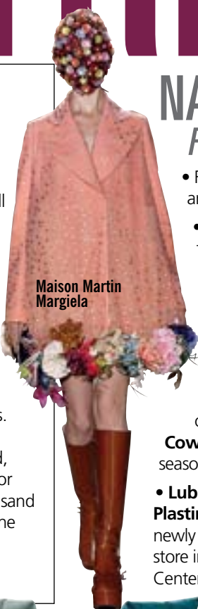
Maison Martin Margiela