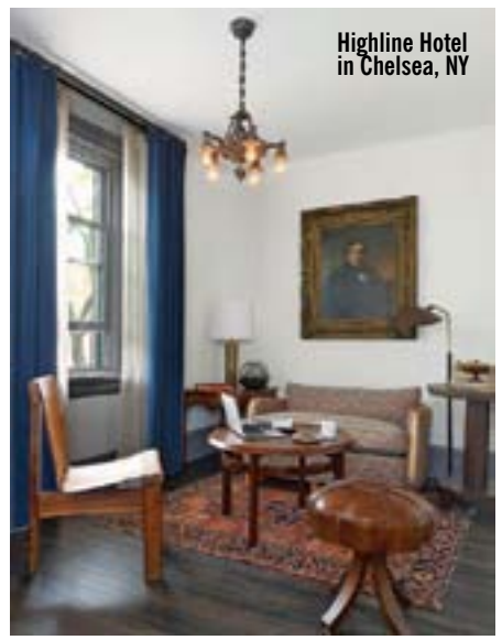
Highline Hotel in Chelsea, NY