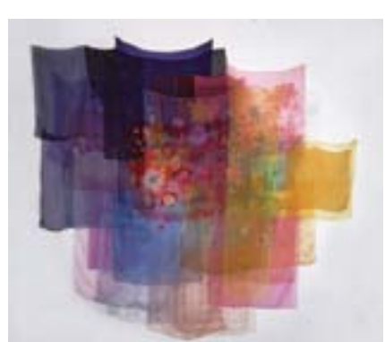
Jeff Koons for Bernardaud