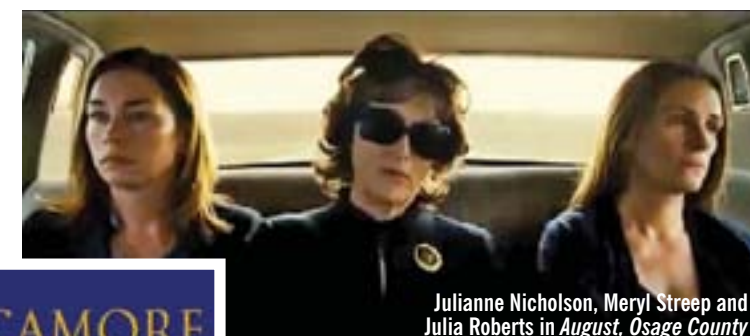
Julianne Nicholson, Meryl Streep and Julia Roberts in August, Osage County