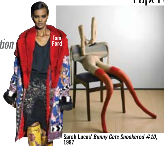
Sarah Lucas' Bunny Gets Snookered #10, 1997