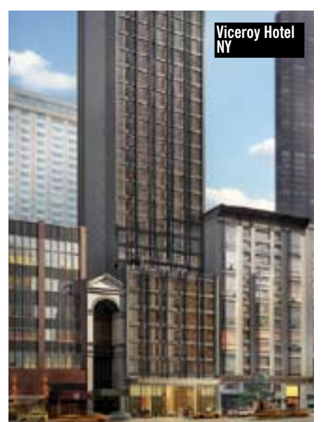
Viceroy Hotel NY

Viceroy Hotel NY Highline Hotel in Chelsea, NY