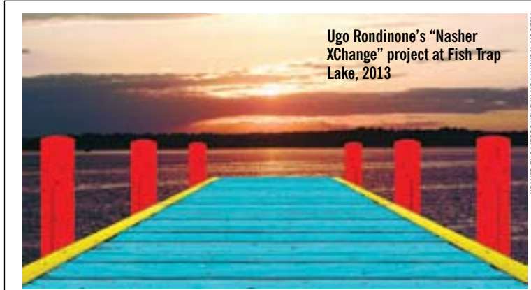
Ugo Rondinone's "Nasher XChange" project at Fish Trap Lake, 2013

• A Halloween trip to Marfa . I haven't been to Marfa in 15 years. Can't wait to see how the little place has evolved!