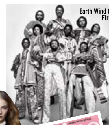
Earth Wind & Fire