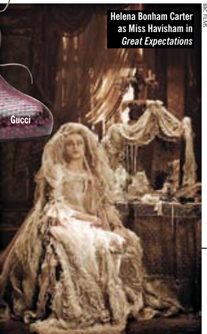
Helena Bonham Carter as Miss Havisham in Great Expectations