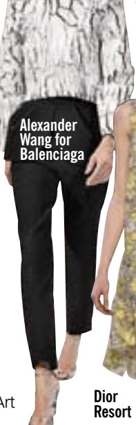
Alexander Wang for Balenciaga