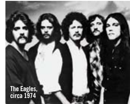
The Eagles, circa 1974