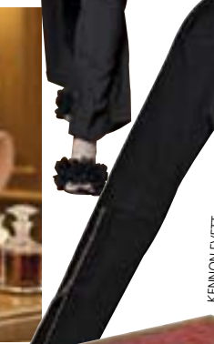
Claridge + King