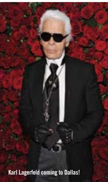
Karl Lagerfeld coming to Dallas!