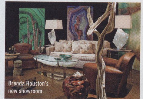
Brenda Houston's new showroom

Designer Brenda Houston rocks. Gemstones and minerals make up her handsome furnishings and decorative objects, all exquisitely exhibited in a new showroom off Riverside Drive near the Dallas Design District. Besides stocking her staple sparklers, the showroom serves as a launch pad for Houston's freshest ideas, such as shimmer wallpaper with a three-dimensional texture in beaded abalone and tiger's-eye patterns (available through Allan Knight Associates). Also new are wood objects — an 8-foot-tall banana-leaf sculpture carved by a Burmese artisan, fossilized wood from Morocco in striking red hues, a massive mounted natural vine from Thailand and tall peaks of termite