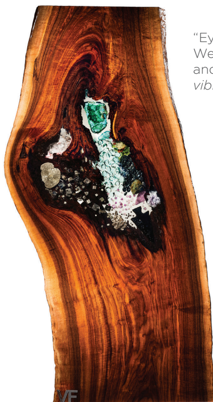
“Eye of the Universe” table by Danna Weiss of claro walnut, fine crystals, and gemstones, $9,000–$40,000, vibrationalfurniture.com .