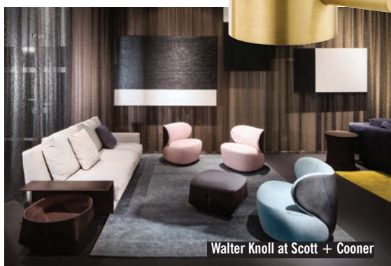
Walter Knoll at Scott + Cooner

Scott + Cooner's newest furnishings have landed in the Dallas showroom, including curvaceous seating by master German furniture maker Walter Knoll and sleek metal candlesticks and tea lights by Danish design house Fritz Hansen. Scott + Cooner, 1617 Hi Line Dr., Suite 100, 214.748.9838, scottcooner.com.