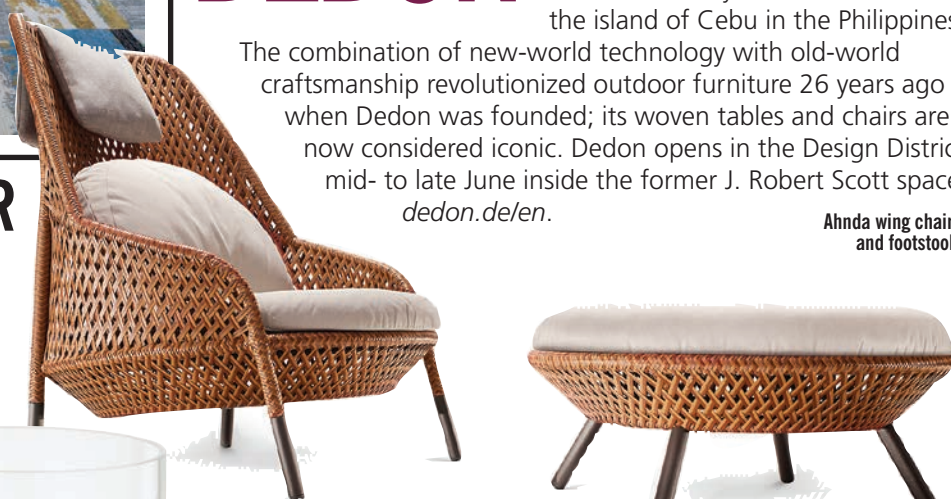
Ahnda wing chair and footstool

Innovative Germany-based outdoor furniture company Dedon's high-tech synthetic fibers are expertly woven into furniture by rattan artisans on the island of Cebu in the Philippines. The combination of new-world technology with old-world craftsmanship revolutionized outdoor furniture 26 years ago when Dedon was founded; its woven tables and chairs are now considered iconic. Dedon opens in the Design District mid- to late June inside the former J. Robert Scott space. dedon.de/en.