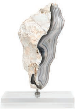
Designers Favorite Accessories Architectural Digest Show