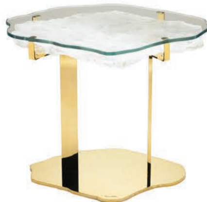
Best In Show International Contemporary Furniture Fair