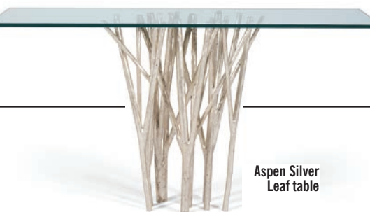
Aspen Silver Leaf table

— Germany's Bauhaus School of Design which produced such greats as Mies Van der Rohe, Marcel Breuer, Charles Eames and Eero Saarinen. Made in the States from an industrial material favored by mid-20th-century designers, its simple, sleek design works in both modern and transitional settings. Price upon request, at Antique Drapery Rod Co., 1937 Irving Blvd., Suite A, 214.653.1733, antiquedraperyrod.com.