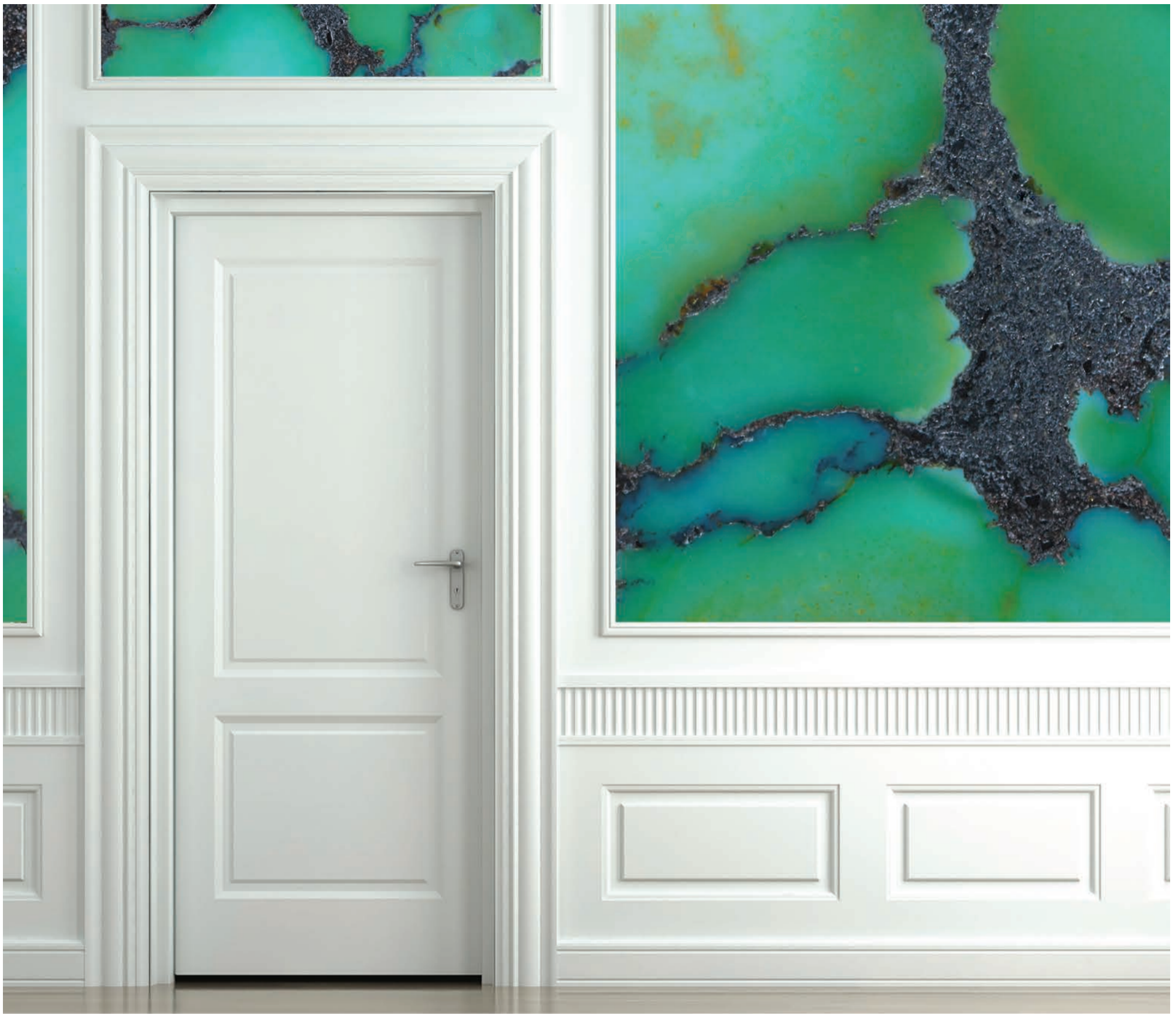
Best in Show for Wallcoverings West Edge Design Fair